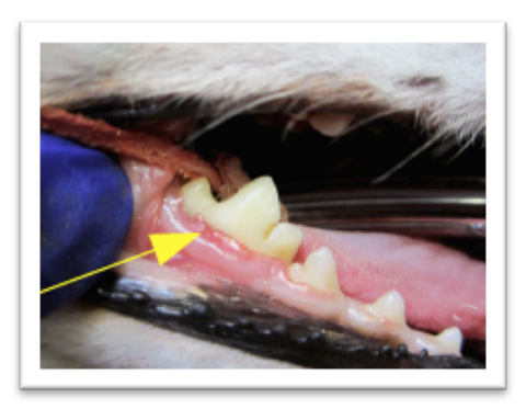
After cleaning, this tooth appears normal on visual examination.

During an awake dental cleaning, the visible tartar is cleaned off the teeth and the teeth are polished. This may make a pet's teeth look nice, but its effectiveness at addressing dental pathology is somewhere between a good brushing and a hygenist's cleaning. An anesthetic dental procedure is analogous to all visits to your dentist within a year or two – dental radiographs are taken and all problem teeth are identified and treated on the same day. Our pets could never sit still for the thorough cleaning and exam under the gumline that happens at your dental office, nor can they sit still for dental radiographs. The photos below are taken from a routine dental procedure. On the left is a photo taken after cleaning, and on cursory visual exam the teeth look great. On the right, an x-ray image of the same teeth reveals abscesses (pockets of pus) on both roots of the large tooth in the photo. If left untreated this would continue be a constant source of pain and infection for the dog, and lead to more problems in the future. Without a complete exam and radiographs, we never would have known this pet was in pain.